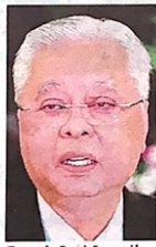
Datuk Seri Ismail Sabri Yaakob

"From here, the Statistics Department will be responsible for