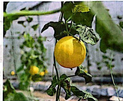
The agriculture sector was the third largest contributor to Terengganu's gross domestic product last year, with a share of 7.5 per cent or RM2.9 billion.

He said various census data, including the dependence of the im-