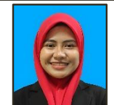
KHAIRUSY ZAWATIL ISHQIE ASOMUDIN MYSTEP